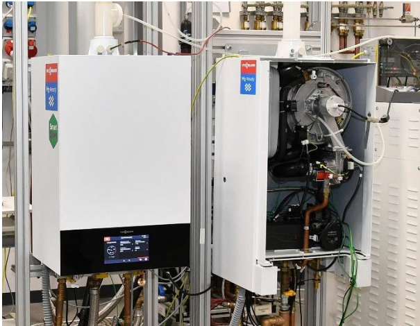
Image 2: Two 100% H2-ready prototypes on the test bed: Testing is followed by the phases of qualification, endurance testing, and ultimately deployment of the new devices in actual heating systems.