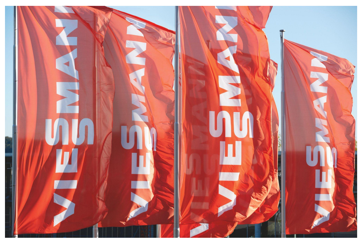
Caption: Viessmann flags in front of the headquarters in Allendorf (Eder).